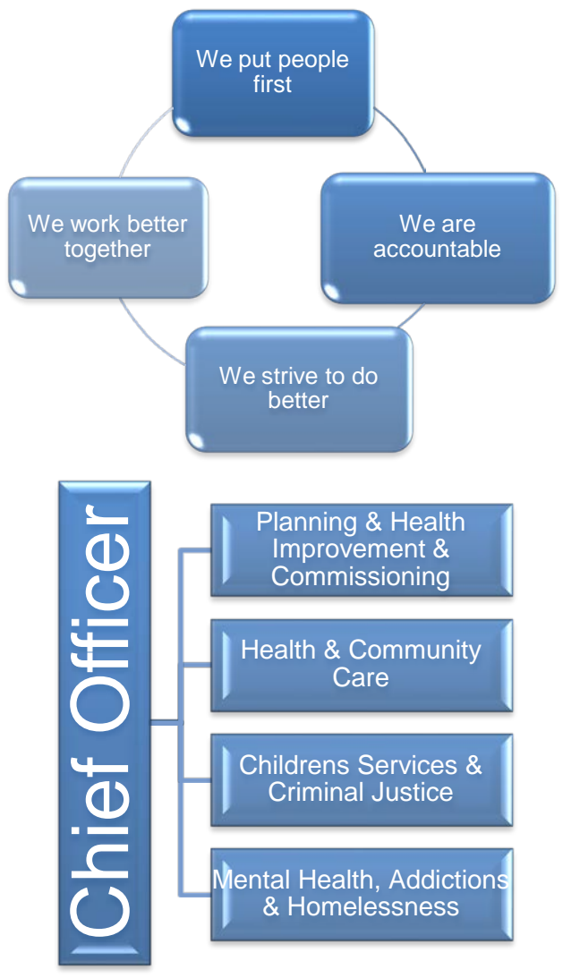
Exhibit 1: IJB Values and Structure

The IJB Strategic Plan is supported by an operational plan and a variety of service strategies, investment and management plans which aid day to day service delivery. These plans and strategies identify what the IJB wants to achieve, how it will deliver it and the resources required to secure the desired outcome. The Strategic Plan also works in support of the Inverclyde Community Planning Partnership's Single Outcome Agreement and the NHS Greater Glasgow & Clyde Local Delivery Plan. It is vital to ensure that our limited resources are targeted in a way that makes a significant contribution to our objectives.